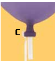
For HELIUM-Filled Balloons

(#48790) Minimum Order: 100 . . . . . $0.094(A) per piece Minimum Order: 1,000 . . . . . $0.070(C) per piece For use with helium-filled 9", 11", 16", and 17" Round Qualatex® and AdRite™ latex balloons. Includes attached 4' White ribbon. Packed 100 per bag.