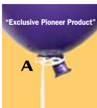
For HELIUM-Filled Balloons