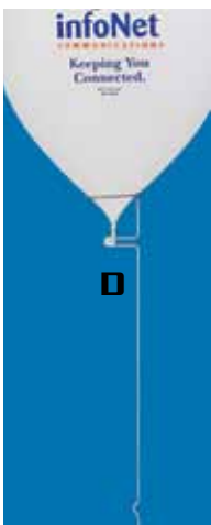
For AIR-Filled Balloons

(#36374) Minimum Order: 1,000 . . . . . $0.112(C) per piece Price includes ProLite Balloon Valves (with a 4' White ribbon attached) inserted into balloons at factory. Available for 9" and 11" Round Qualatex and AdRite latex balloons. A helium regulator with a Flex-Tip Nozzle can be used for inflation.